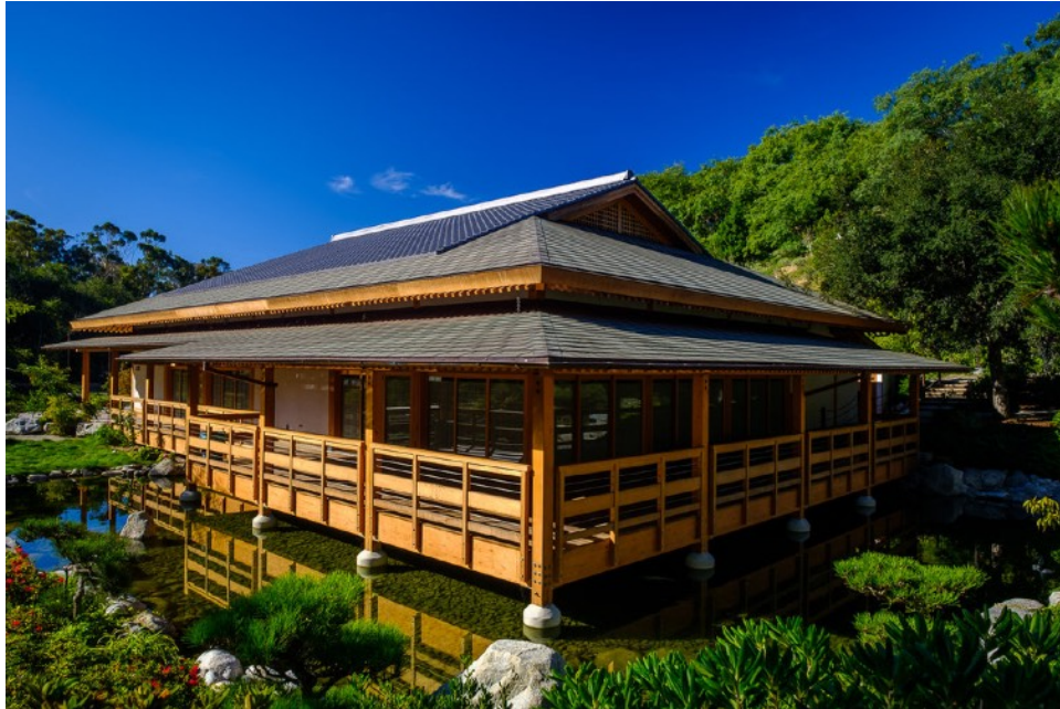
The LEED-certified Inamori Pavilion at Japanese Friendship Garden in Balboa Park, designed by Kotaro Nakamura, offers views of a cascading waterfall and koi ponds. Oct. 6, 2016.

Join the Society for Asian Art for two full days in San Diego! Balboa Park is home to three institutions that boast significant collections from Japan, China, India and elsewhere in Asia: the Mingei International Museum, Japanese Friendship Garden, and San Diego Museum of Art. We will also visit the Chinese Historical Museum and a renowned private collection of Japanese ceramics. Our tour ends on a festive note in Old Town, where we will enjoy the best Mexican food north of the border. Our base for this tour will be the award-winning Solamar San Diego , situated in the lively Gaslamp District, within walking distance to many restaurants.