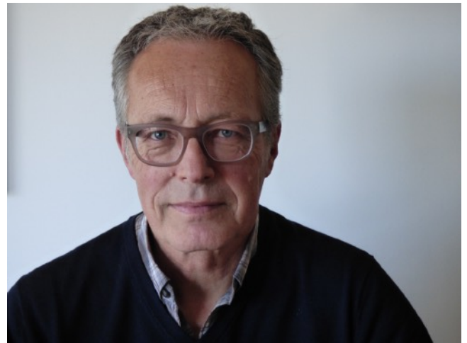
Left: Magnet TV, 1965. Center: SFMOMA Nam June Paik exhibition catalogue. Right: Dr. Rudolf Frieling.