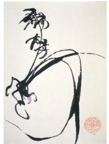
Orchid, approx. 1700–1800. China. Qing dynasty (1644–1911). Ink on paper. Asian Art Museum, Transfer from the Fine Arts Museums of San Francisco, Gift of an anonymous donor, B69D51.

In Chapters 21-40, the life of the Ximen family compound continues to be punctuated by episodes of jealousy and other eruptions of turbulence. No longer adding permanent members to his harem, Ximen Qing engages in fleeting sexual trysts with servants and other minor characters, sowing the seeds of current and future conflict. Just when this debauchery seems unsustainable, or his multiple misdeeds threaten legal consequences, Ximen Qing not only manages to escape but even discovers new luxuries. Cuisine, couture, horticulture, and especially jewelry and other accessories—we will explore the material richness of fin-de-siècle Ming society portrayed in the magnificent David Roy translation of this novel, this volume of which is subtitled The Rivals .